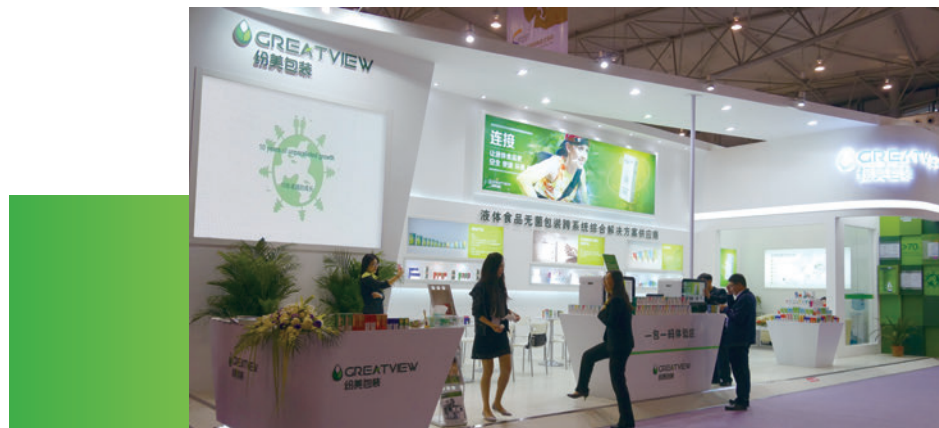
The world's first aseptic packaging One Code per Pack technology unveiled in the Food and Drinks Fair in Chengdu

Progress has also been made in new customer development in all regions including South East Asia. We believe 2019 will be a year of strengthening our business fundamentals in order to prepare for an exponential growth to the international market.