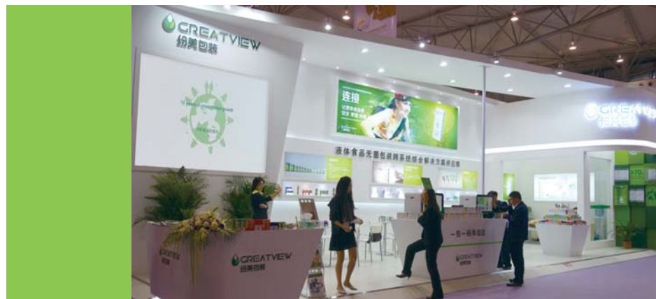
The world's first aseptic packaging One Code per Pack technology unveiled in the Food and Drinks Fair in Chengdu

Following consecutive years of very strong growth of our international business, we had taken a decision to add the second production line of 4 billion packs annual production capacity and to expand the warehouse for our European plant at Halle Germany at the end of the first half of 2016. These new production facilities, estimated at a total investment of around 23 million Euros, are expected to be commissioned in mid-2017. The additional equipment and building expansion will add capacity, flexibility and efficiency to our operations while helping to deliver responsive service and optimal products to customers. This investment, we believe, will more than double the annual production capacity of the factory, and is a vote of confidence in the continuing growth in our market share.